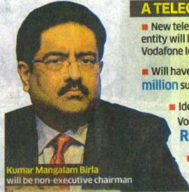
Kumar Mangalam Birla will be non-executive chairman